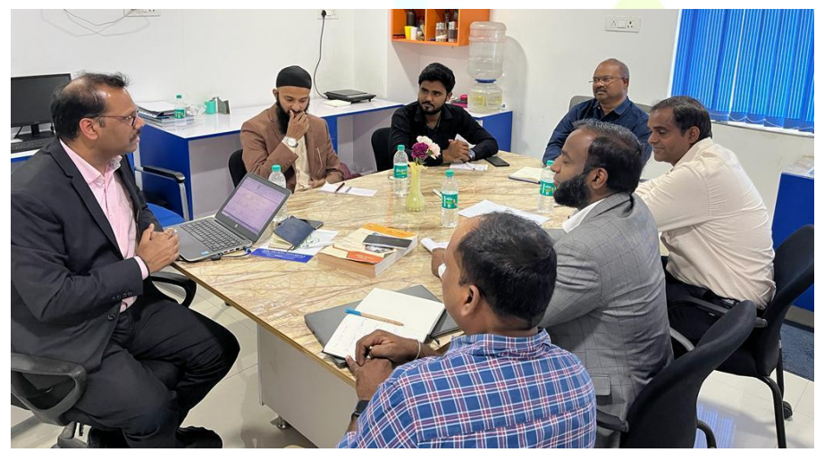
Glimpse of meeting at Pharma Pathshala