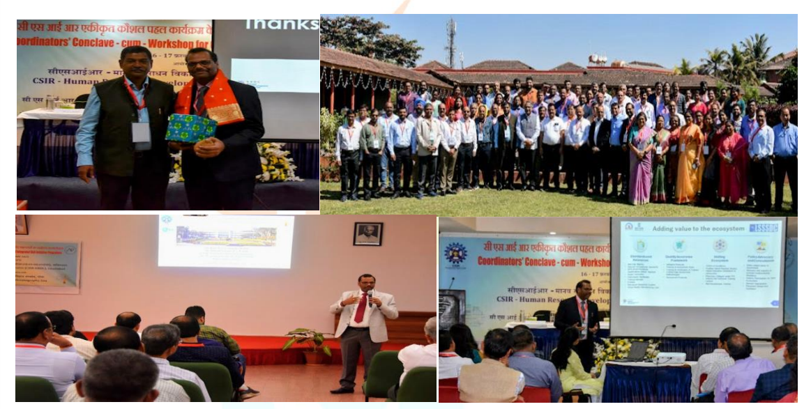
Glimpse of the LSSSDC at Coordinator Conclave

LSSSDC has come out as the chosen Key Collaboration Partner Body by majority of CSIR Laboratories under CSIR-Integrated Skill Initiative under Skill India Mission. A workshop was addressed by Sr Director, LSSSDC in Goa for all Program Coordinators of 37 CSIR Laboratories with a vision of enabling Life Sciences CoEs based in these laboratories in time to come.